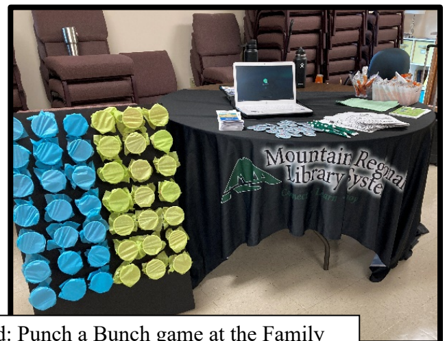
Pictured: Punch a Bunch game at the Family Connections' "Back to School" event.

We are continuing our monthly cultural celebrations. On November 16 th from 3:30 – 4:30, we will be having a Native American cultural celebration with books and food. Storytime at Towns County Library will continue every Tuesday at 10:30.