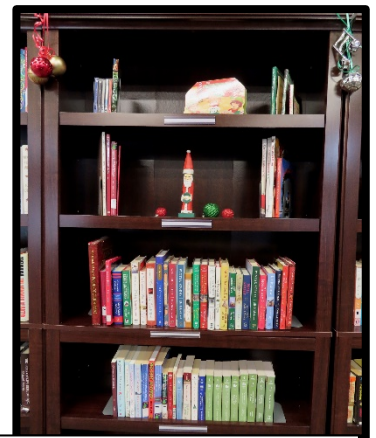
Pictured: Some Christmas items in our FOLTC Book Store.

We continue to use the honor system (red money boxes) for payment in both stores. Christmas books are $2.00 for hardbacks and 50 cents for paperbacks, children's books, and DVDs. Shop early for the best selection and enjoy!